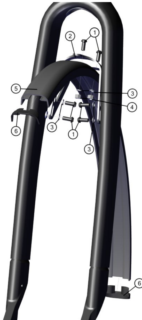
KFF0002 Front Fender KIT Square Urban MY 2018